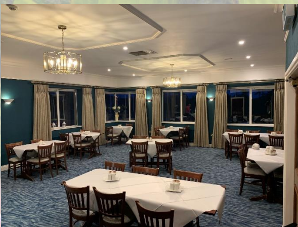
Our newly renovated Dining Room