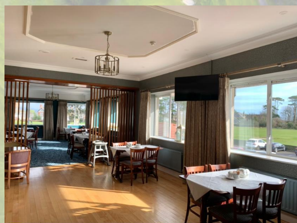
Our newly renovated Maple Room